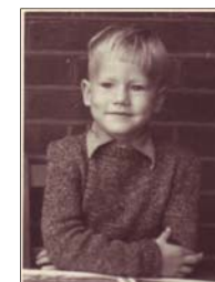
Some Pictures of Past Pupils

On the last Friday of the term each class held a birthday party, cakes provided by Serendipity and on the last day of term a concert was held with the children